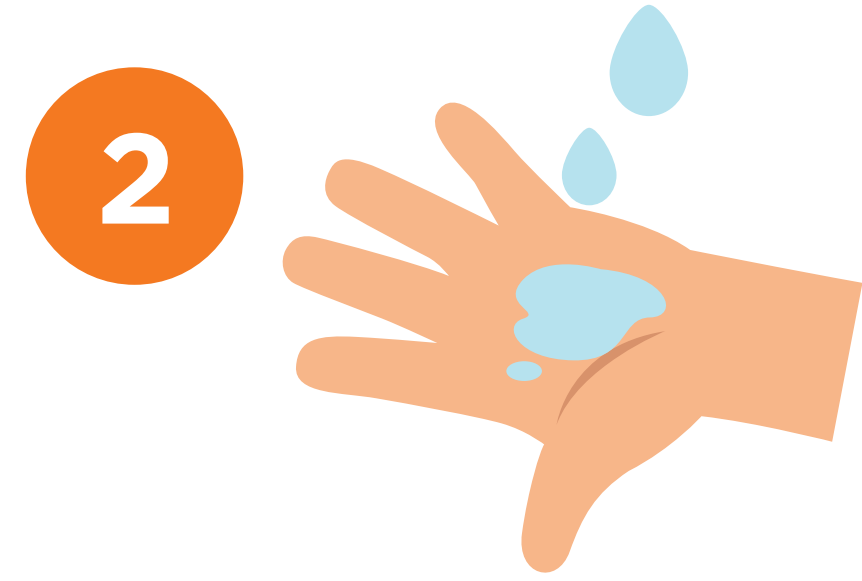
2 Apply Soap (Enjabonar)