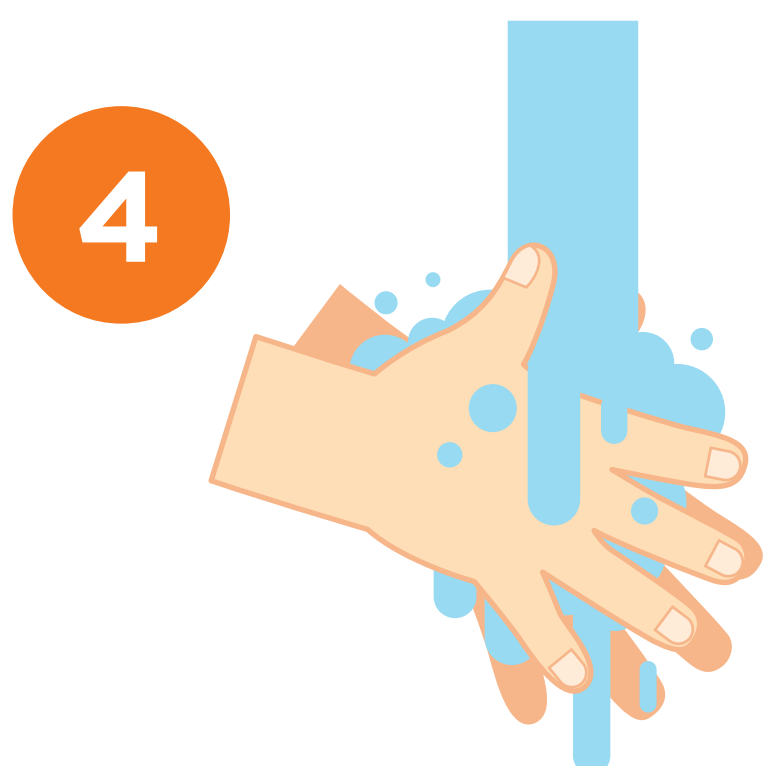
4 Rinse Hands Thoroughly (Enjuagar)