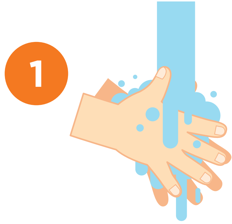
1 Wet/Pre-rinse (Mojar)