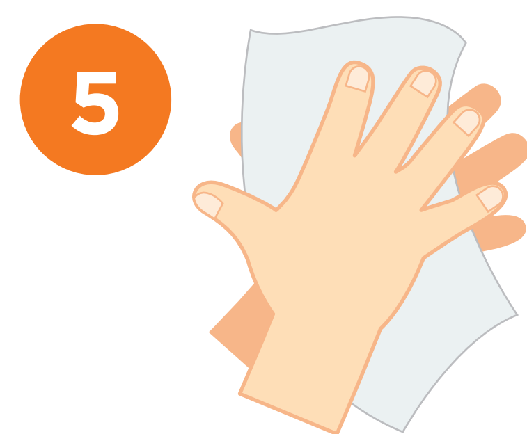
5 Dry with Paper Towel (Secar)